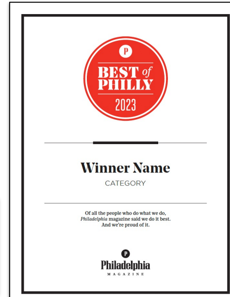
Best of Philly Wall Plaque