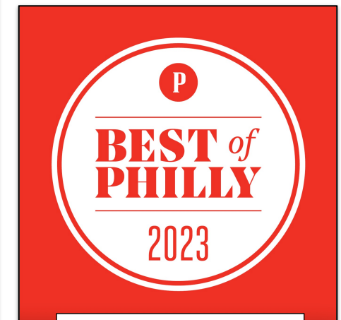
Best of Philly Decal

Ready to get started? Submit your video materials here!