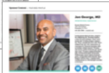
Top Doctors Featured Profiles Deadline: March 15, 2019