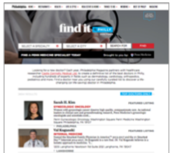
Enhanced Directory Listings Phillymag.com