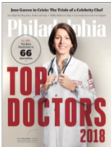
Run of Book Brand Advertisement Deadline: March 22, 2019